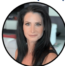
Perioperative Nurse Executive & Anesthesia Consultant