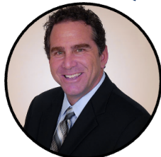
Principal & Anesthesia Consultant